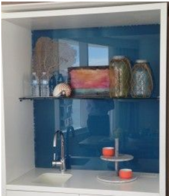
At the Bar

The Commissioned pieces in their final home in Miami Beach