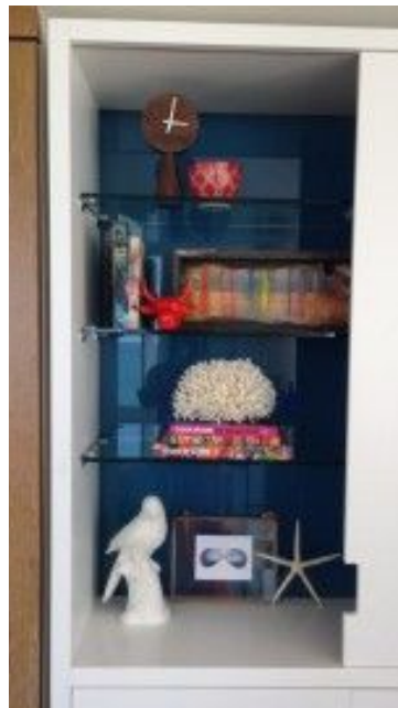
In the Bookshelf