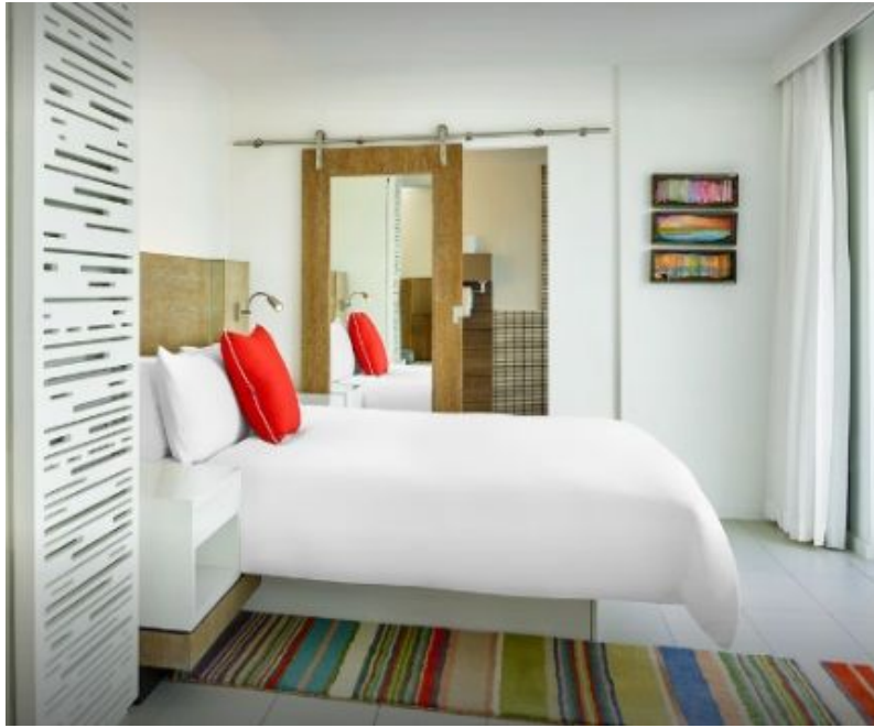
In a King Suite